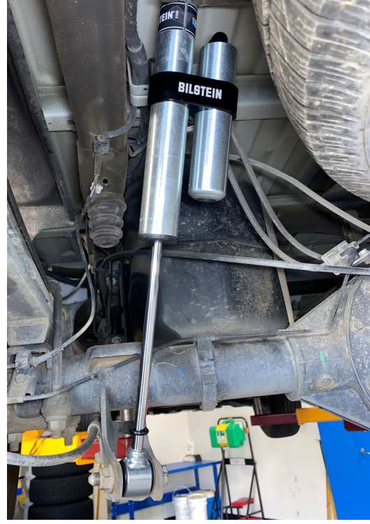
Figure 1. driver side