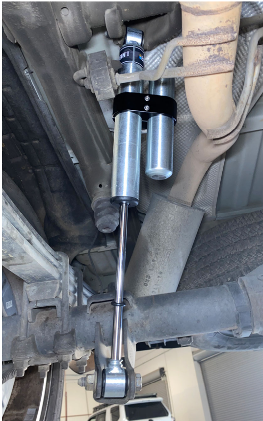
Figure 3. passenger side (rear view)