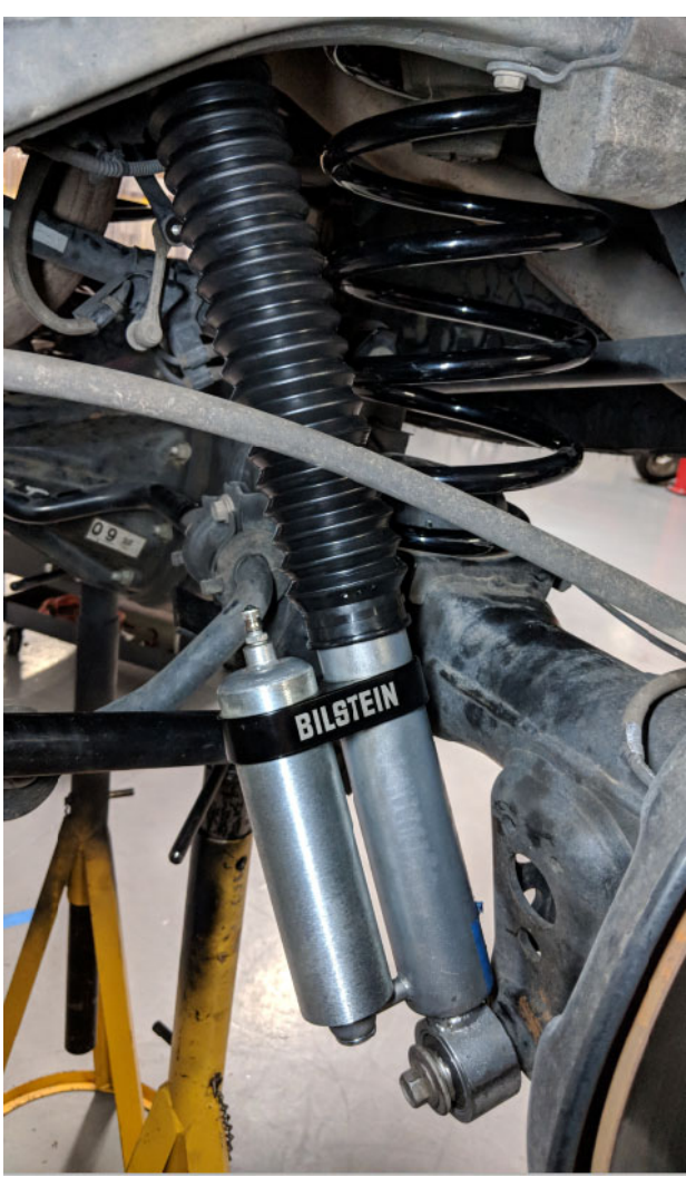
Figure 2 – RIGHT REAR