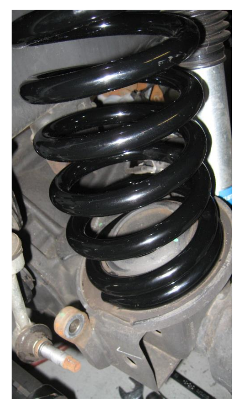
Figure 7. Driver side (pictured with Bilstein 5100 shocks)