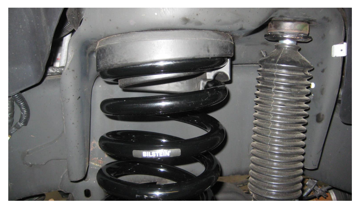
Figure 6. Driver side (pictured with Bilstein 5100 shocks)