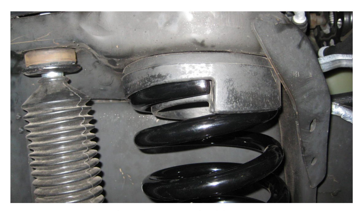
Figure 4. Passenger side (pictured with Bilstein 5100 shocks)