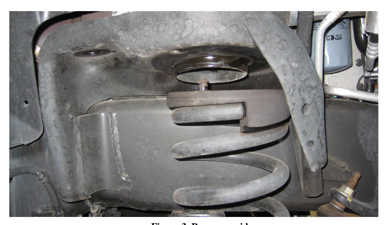
Figure 3. Passenger side