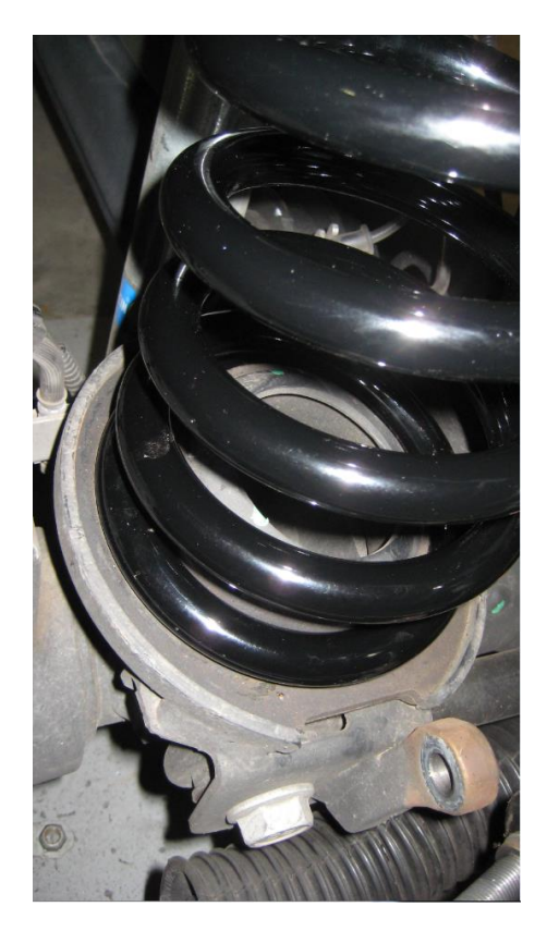
Figure 5. Passenger side (pictured with Bilstein 5100 shocks)