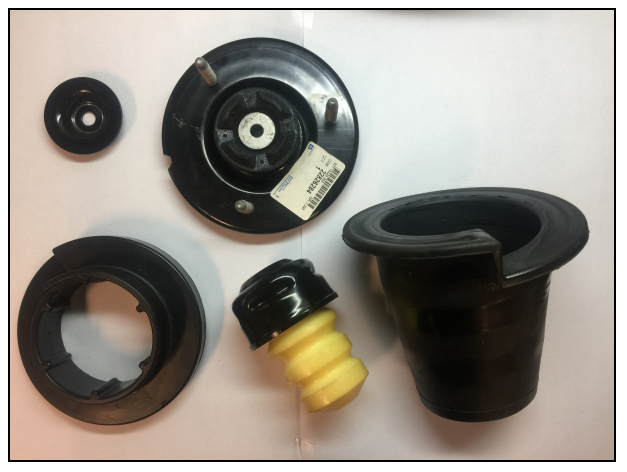
Fig 2: 2014+ OE GM 1500 and 2015+ Tahoe Top Mount Components