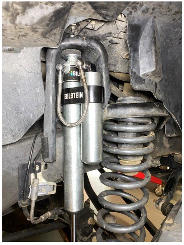
Figure 2. front passenger side