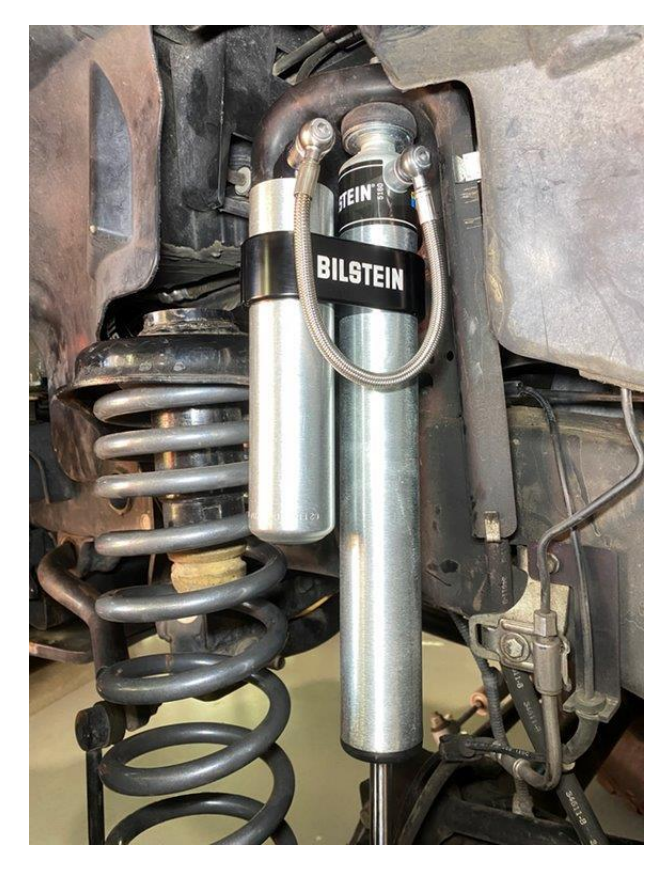
Figure 1. front driver side