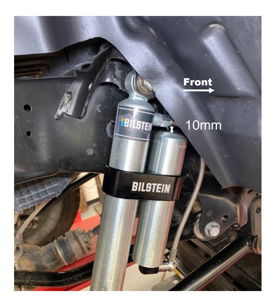
Figure 2. Rear passenger side