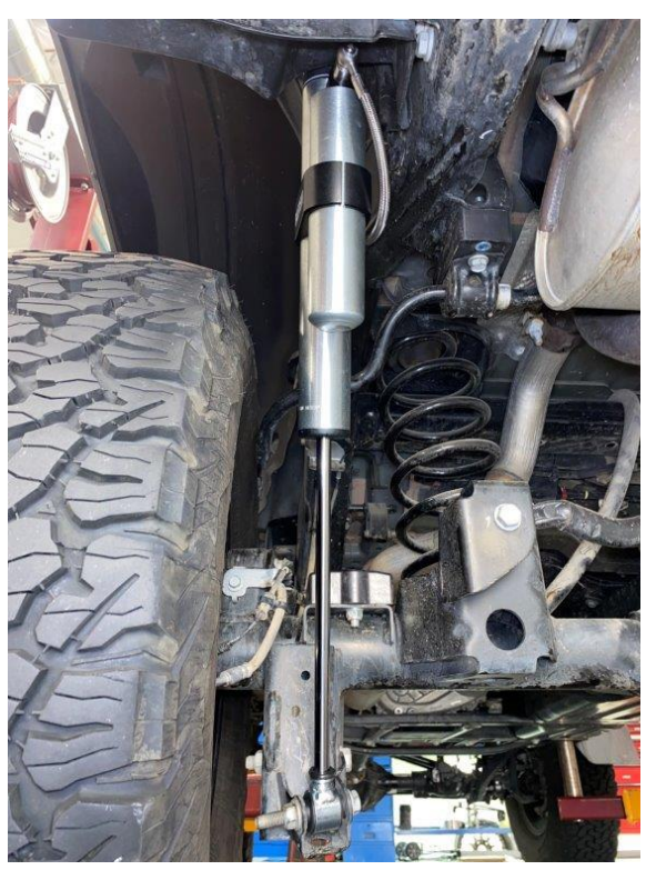
Figure 2. Rear Driver Side