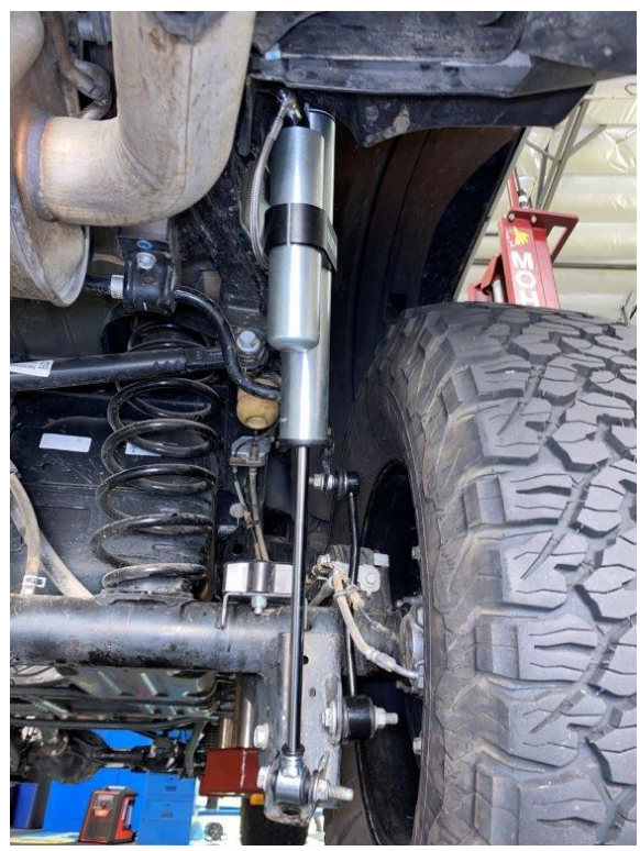
Figure 3. Rear Passenger Side